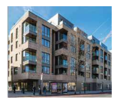
Camberwell on The Green