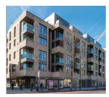
Camberwell on The Green